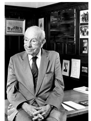
Willard van Orman Quine